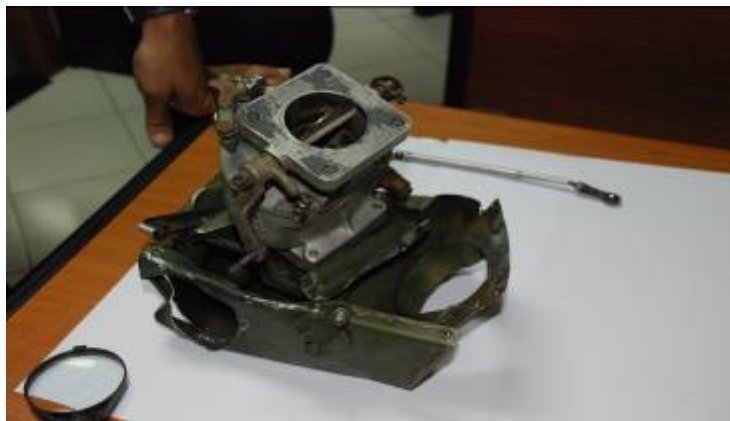
Figure 1: The carburettor ex. PK-SDP

The carburettor inspection found the bolt still attach on throttle arm, without rod end, nut and split pin ( Figure 3Figure 1 ).