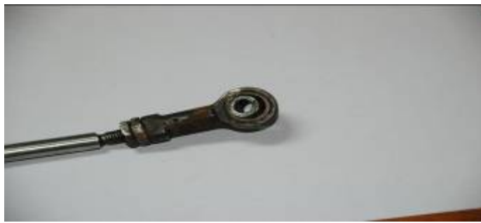
Figure 2: The rod end detached from bolt attachment

The rod end detached from bolt attachment, however, there was not found damaged compulsively ( Figure 2 ).